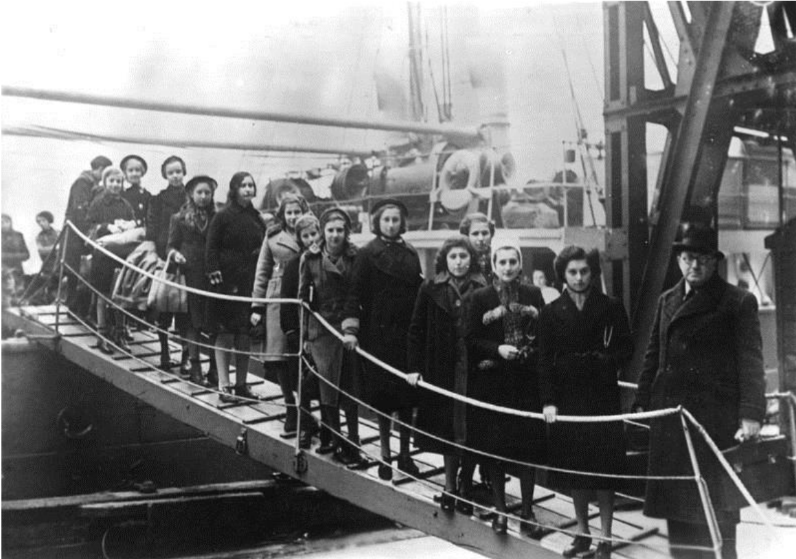
Jewish refugee children arriving in London, 1939

In November 1938, five days after Kristallnacht, the "Night of Broken Glass" in Germany and Austria, a delegation of British, Jewish, and Quaker leaders appealed to the Prime Minister Neville Chamberlain to allow Jewish children into Britain from Nazi occupied Europe, without their parents. They promised to find homes for all the children. Every child would have a guarantee of £50 sterling. It was expected that the children would stay in the country only temporarily. [2]