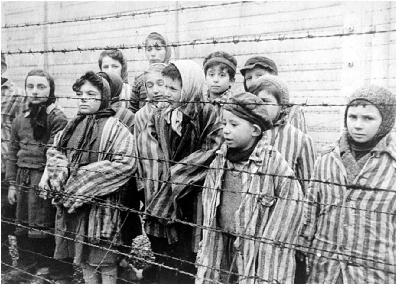
Child survivors at Auschwitz concentration camp

Josiah Wedgwood had worked ceaselessly to try to help Jews and others to flee from Nazi oppression. What happened to those Jewish people who were unable to get out of Germany and the countries it occupied?